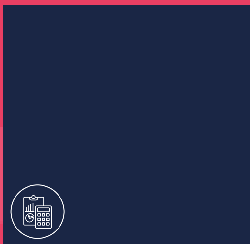
Professional Accounting Technician Level 4